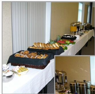
DELUXE CONTINENTAL BREAKFAST