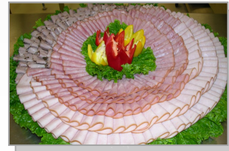
BUILD YOUR OWN SANDWICH DELI TRAY